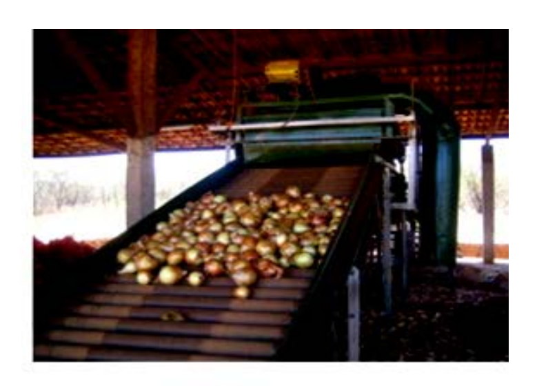
Picking / Separation / Categorization the onion